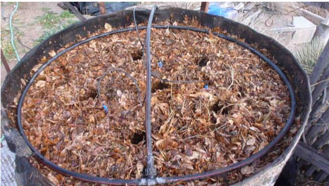
Figure 8. Irrigation System for a Johnson-Su Composting Bioreactor

To irrigate the system, I use a circular piece of \frac{1}{2} " landscape hose that snakes around the top perimeter of the bioreactor (Figure 8). I drill \frac{1}{16} " holes into the bottom of the hose every 4-5", and also I drill some holes horizontally in the hose about every 6". The horizontal holes spray towards the center of the bioreactor to thoroughly wet all the material. I connect the ends of this hose with a plastic landscape T-hose fitting that has two \frac{1}{2} " female push-compression fittings and a female hose-bib thread (Figure 9). Once the water has been sprayed onto the top of the compost substrate, gravity will pull the water from the top of the pile into the rest of the compost substrate.