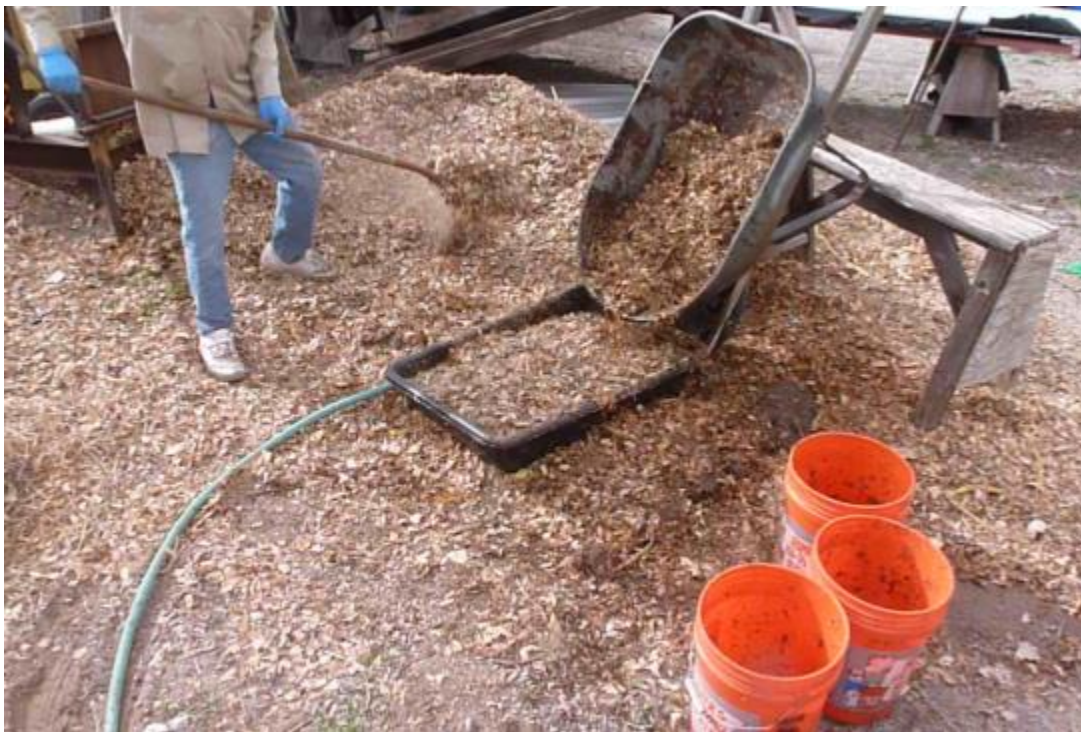
Figure 6. Setup for Wetting Feed Materials

Once the feed materials are thoroughly wet, I use a pitchfork to lift them into a wheelbarrow that is braced into a tilted position (Figure 6) so that water can drain off of the feed material and back into the water-bath tray. This uses the water efficiently.